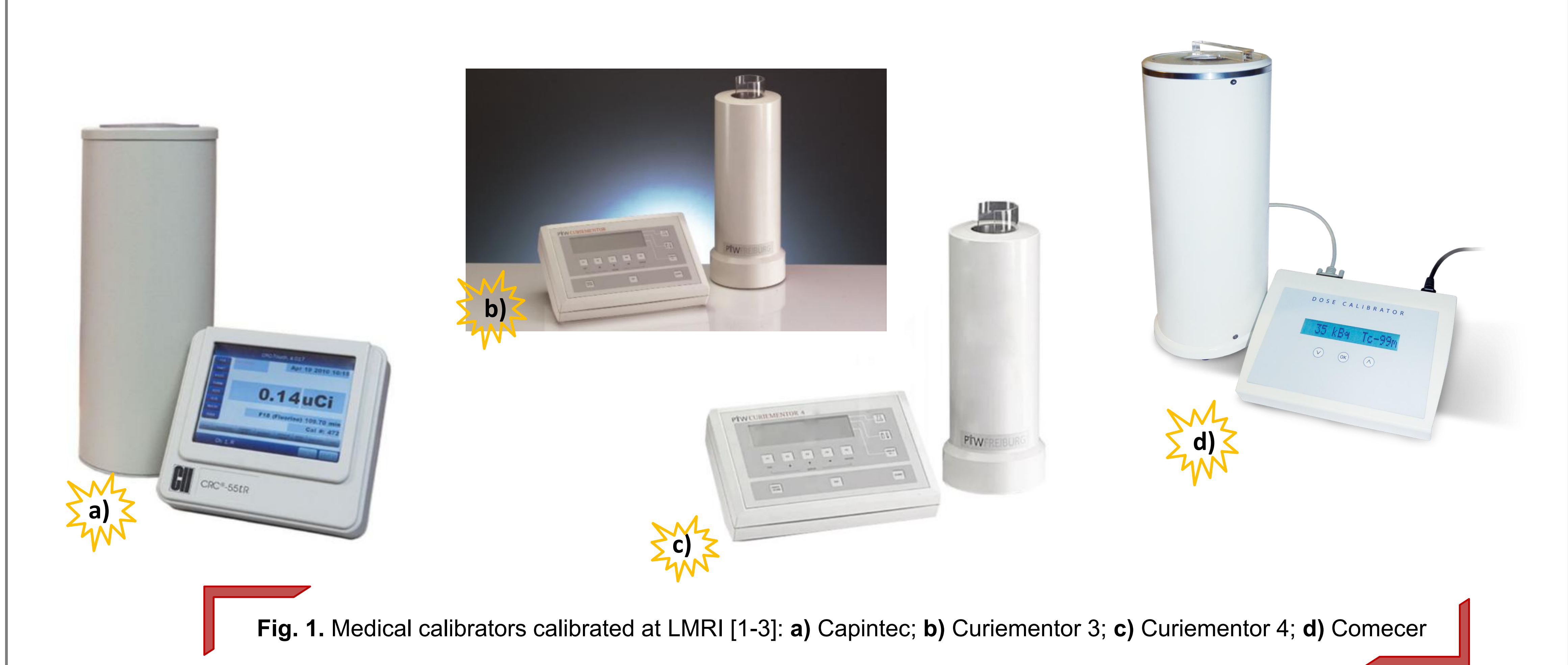
Fig. 1. Medical calibrators calibrated at LMRI [1-3]: a) Capintec; b) Curiementor 3; c) Curiementor 4; d) Comecer